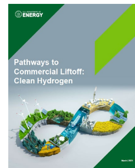
Department of Energy, Pathways to Commercial Liftoff: Clean Hydrogen